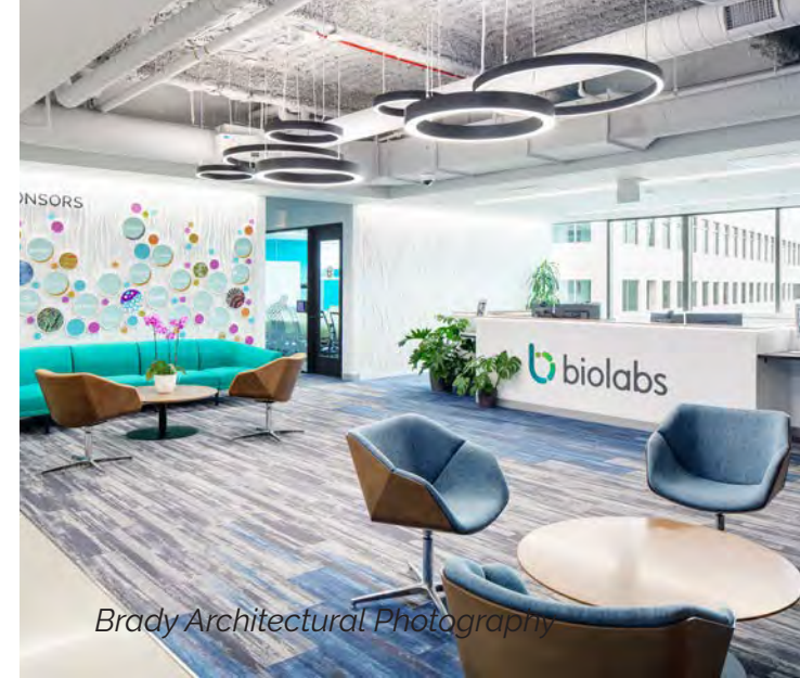
Brady Architectural Photography